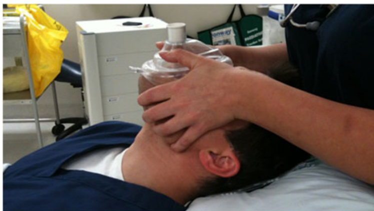
Figure 2. Thenar eminence type grip.

mandatory ventilation (SIMV+) and post-ventilation care continues