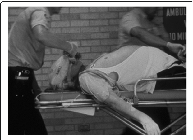
Figure 1 Endotracheal intubation in the out-of-hospital setting. In the early years of out-of-hospital emergency medical services (EMS) systems, advanced life support personnel were not only trained in the nuances of how to avoid overzealous ventilation and properly place an endotracheal tube in very challenging circumstances, but they were also well-supervised on-scene by expert physicians who themselves were highly-experienced and exceptionally familiar with those challenges as well as methods to overcome them (photo by Dr. Paul Pepe).

Even if initial training techniques are expert and well-taught, both in the classroom and on-scene, frequency of performance is a critical factor. For example, studies have shown the success rates for ETI can be related to the deployment strategy of the EMS system [2,3,32,33]. In EMS systems using tiered ambulance deployments in which paramedics (ALS providers) are spared for the most critical calls, many fewer paramedics are needed on the roster and the individual experience of each paramedic, including frequency of ETI performance, can be enhanced