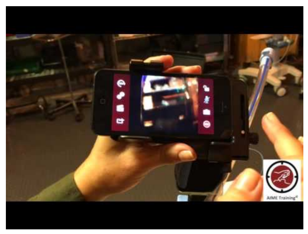
Click here to watch video on YouTube

The recently released iphone adapter for Airtraq. Pretty easy to use with good quality video (dependent on iphone camera) with the advantage of video recording. A great teaching adjunct for sure. This attachment may influence success via improved laryngoscopy ergonomics in its ability to allow early visualization of blade placement without having to bend over patient.