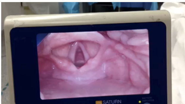
Fig. 1 Full view of the larynx obtained with the GlideScope GVL video laryngoscope (Group F)