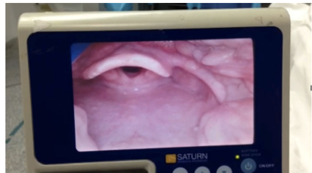
Fig. 2 Deliberately restricted view of the larynx obtained with the GlideScope GVL video laryngoscope (Group R). Only part of the larynx is visualized, and the blade and camera are positioned farther away from the larynx